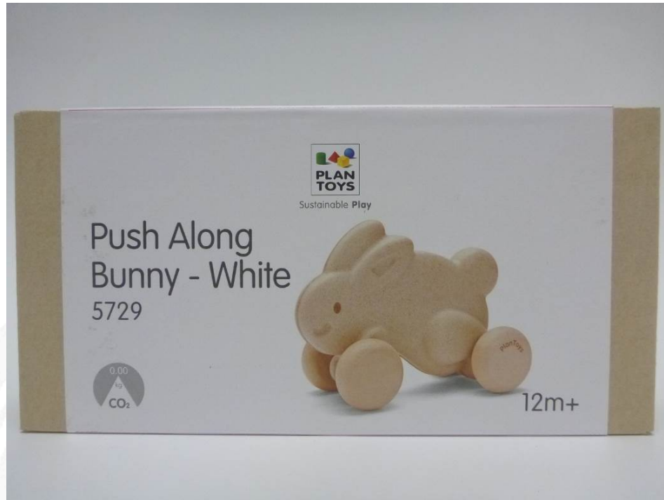
5729 PUSH ALONG BUNNY – WHITE