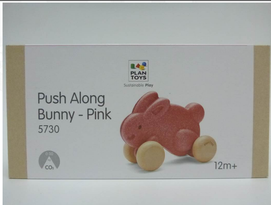
5730 PUSH ALONG BUNNY – PINK