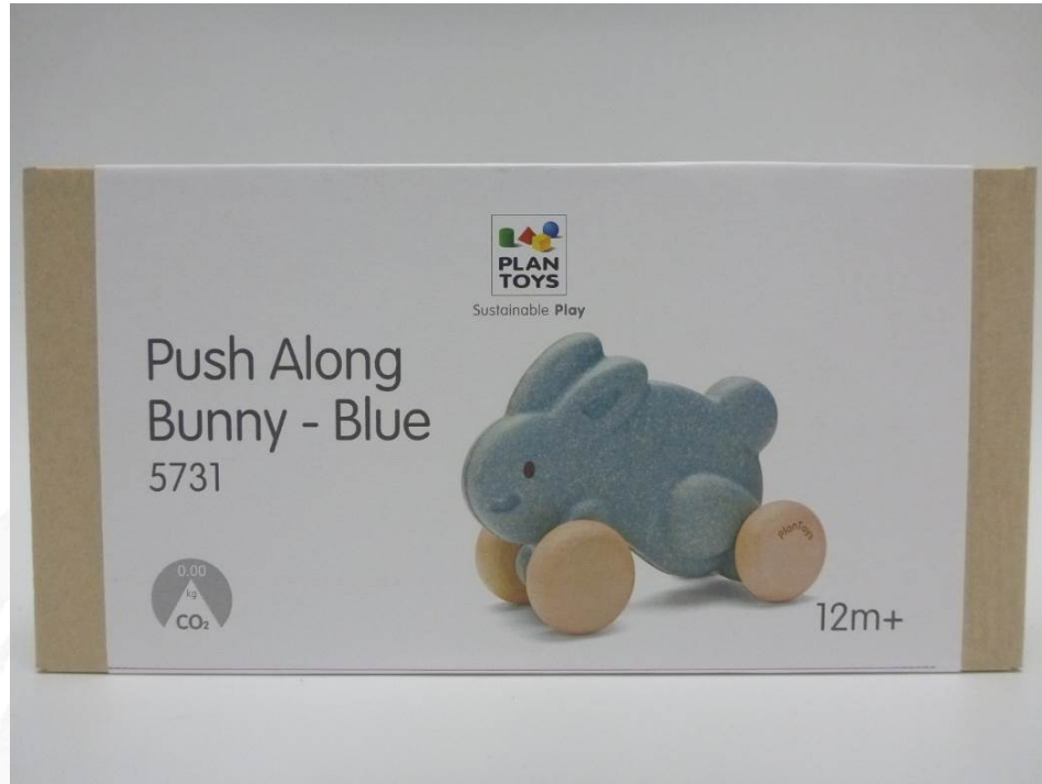
5731 PUSH ALONG BUNNY – BLUE