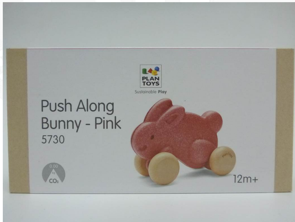
5730 PUSH ALONG BUNNY – PINK