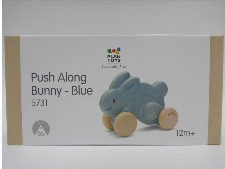
5731 PUSH ALONG BUNNY – BLUE